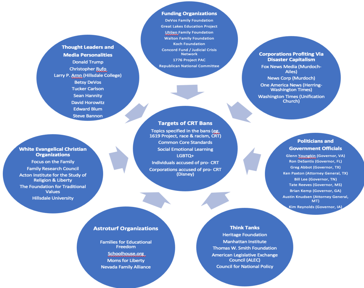
Figure 1: Major Players in the Anti-CRT Movement

In Figure 1 the main players in the anti-CRT efforts are organized into six distinct groups: 1) funding organizations, 2) Thought leaders and media personalities, 3) Conservative White evangelical Christian organizations, 4) Corporations, 5) Politicians and government officials, and 6) Think tanks. However, numerous individuals active in the Anti-CRT moral panic and disaster capitalism play multiple roles, moving from private to public sector and back. For example, using information from Ballotpedia.org and ProPublica’s Nonprofit explorer, we coded Betsy DeVos as a “thought leader” not just because of her important role in promoting school vouchers in her home state of Michigan, and her position as Secretary of Education under Trump, but also because she is co-director of the DeVos Family Foundation, which supports charter and parochial schools across the country (Ballotpedia, 2023). Her natal family foundation, the Prince Family Foundation (directed by DeVos’s brother, Erik Prince), also funds the conservative evangelical Christian Hillsdale University and the lobbying organizations Focus on the Family and the Family Research Council (Focus on the Family, 2019). Similarly, before Glenn Youngkin became Governor of Virginia, running on the anti-CRT moral panic, he spent nearly three decades working for Accelerate Learning, including serving as CEO from the acquisition of that company by the Carlyle Group in 2018 until his campaign began in 2020 (Dickinson, 2018).